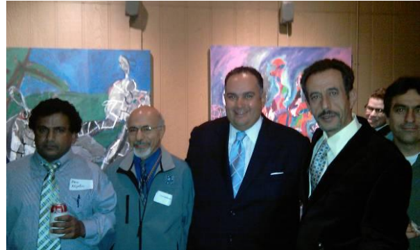
Assembly Speaker John A. Pérez was also present and met with the San Diego Section officers.