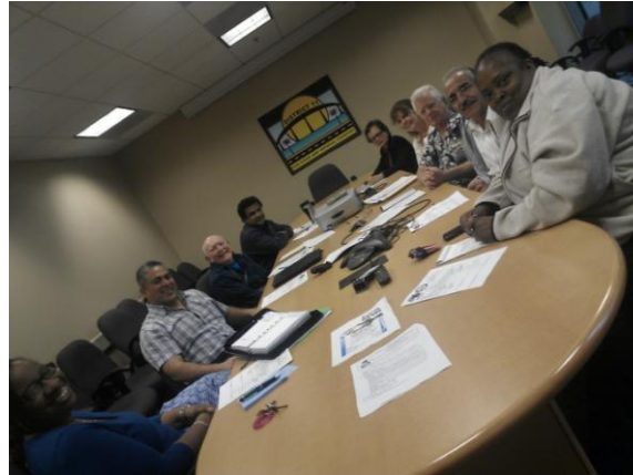
DAC Committee members in their monthly meeting