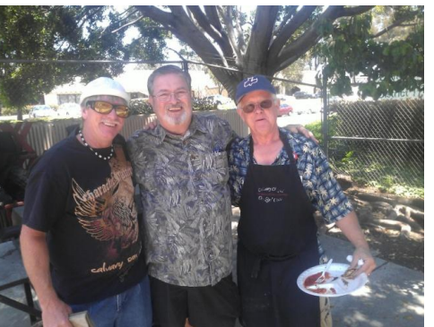
DAC Members and friends helped B-BQ the Fish