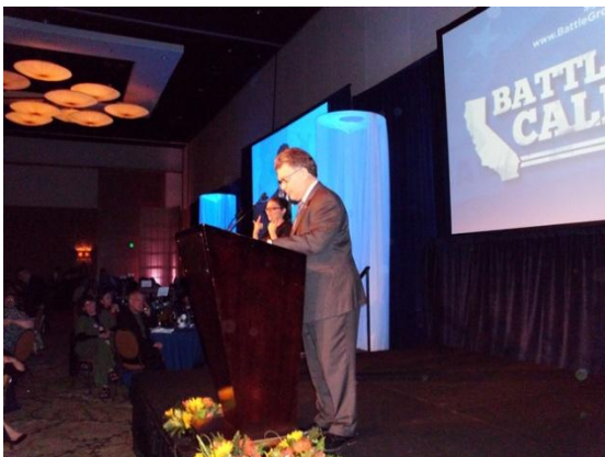
US Senator Al Franken