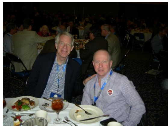
Various PEGC members/staff attended