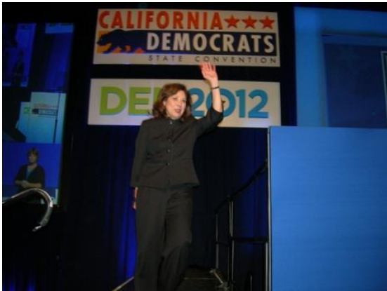
US Secretary of Labor Hilda Solis