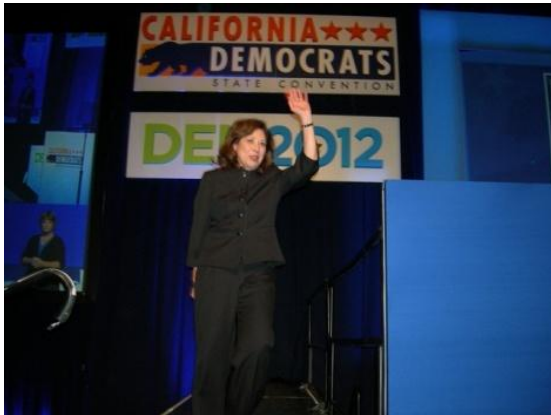
US Secretary of Labor Hilda Solis