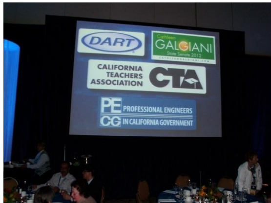
PECG was one of the Convention Sponsors