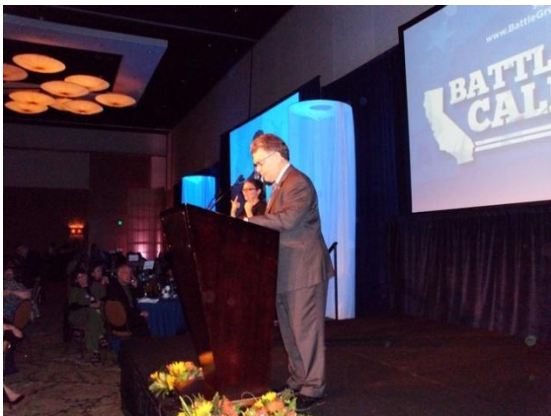
US Senator Al Franken

Other speakers included Senator Diane Feinstein , Speaker Nancy Pelosi , and Congresswoman Maxine Waters , Speaker John Perez and other politicians and Party