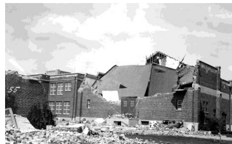
Long Beach, California, Earthquake March 10, 1933. Compton Junior High School, Compton, Ca. View showing extensive damage to the rear of the main school building.

The major topic of discussion revolved around PECG's push to have legislation enacted that would place the responsibility of the inspection of the construction of school and university buildings directly with DSA.