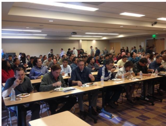
Lunch was provided for the members by the San Diego Section prepared by the D-11 Cafeteria