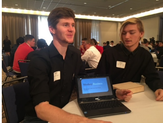
Students from mentor day displaying their unique business design model.

Mentor day was held on Friday, September 22, 2017. PECG attended the event and were able to talk with your students and listen to their ideas and provide some feedback for them. This event is a great opportunity for PECG members to give back to the community. Way to go.